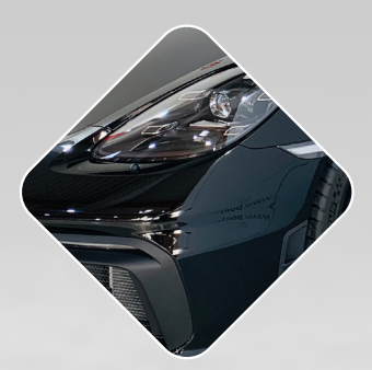
BFBLACK Deep black gloss 150 µm