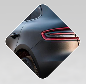
BodyfenceM Clear matt 150 µm