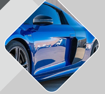
BodyfenceX Clear gloss 150 μm