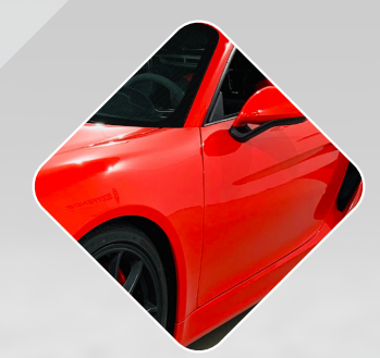
Bodyfence Clear gloss 150 µm