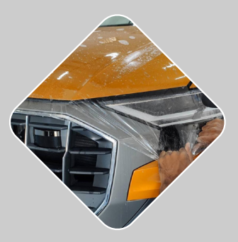
BodyfenceP Clear gloss 180 µm