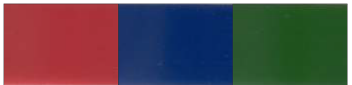
Gloss Red Gloss Blue Gloss Green