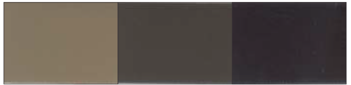
Gloss Bronze Gloss Dark Brown Gloss Black