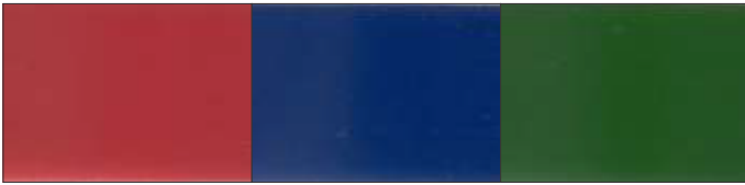
Matte Red Matte Blue Matte Green