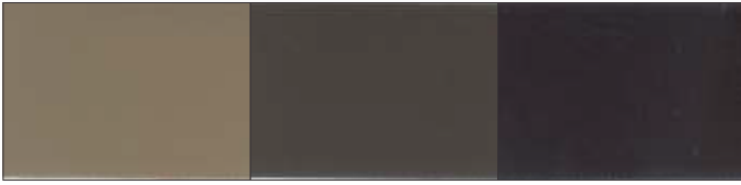
Matte Bronze Matte Dark Brown Matte Black