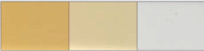
Matte Gold Matte Champagne Matte Natural