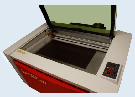
2. Load and mark material