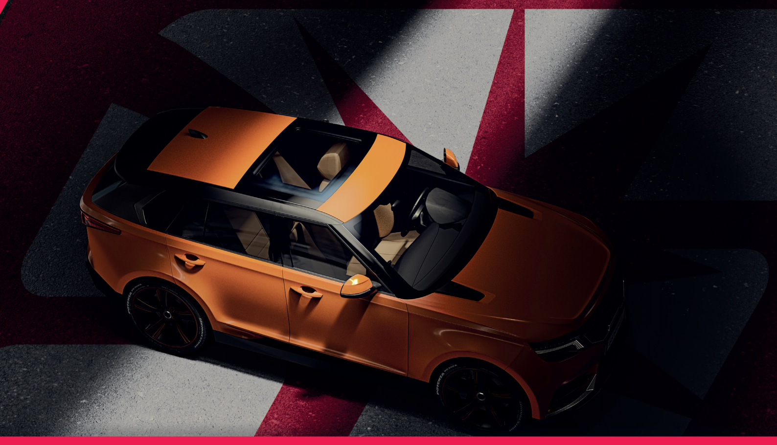
HEXIS, A GLOBAL NETWORK ORDER AND GET DELIVERED ANYWHERE IN THE WORLD